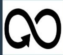
Continuous Business Development